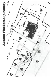
Auszug Flurkarte (1:1000)