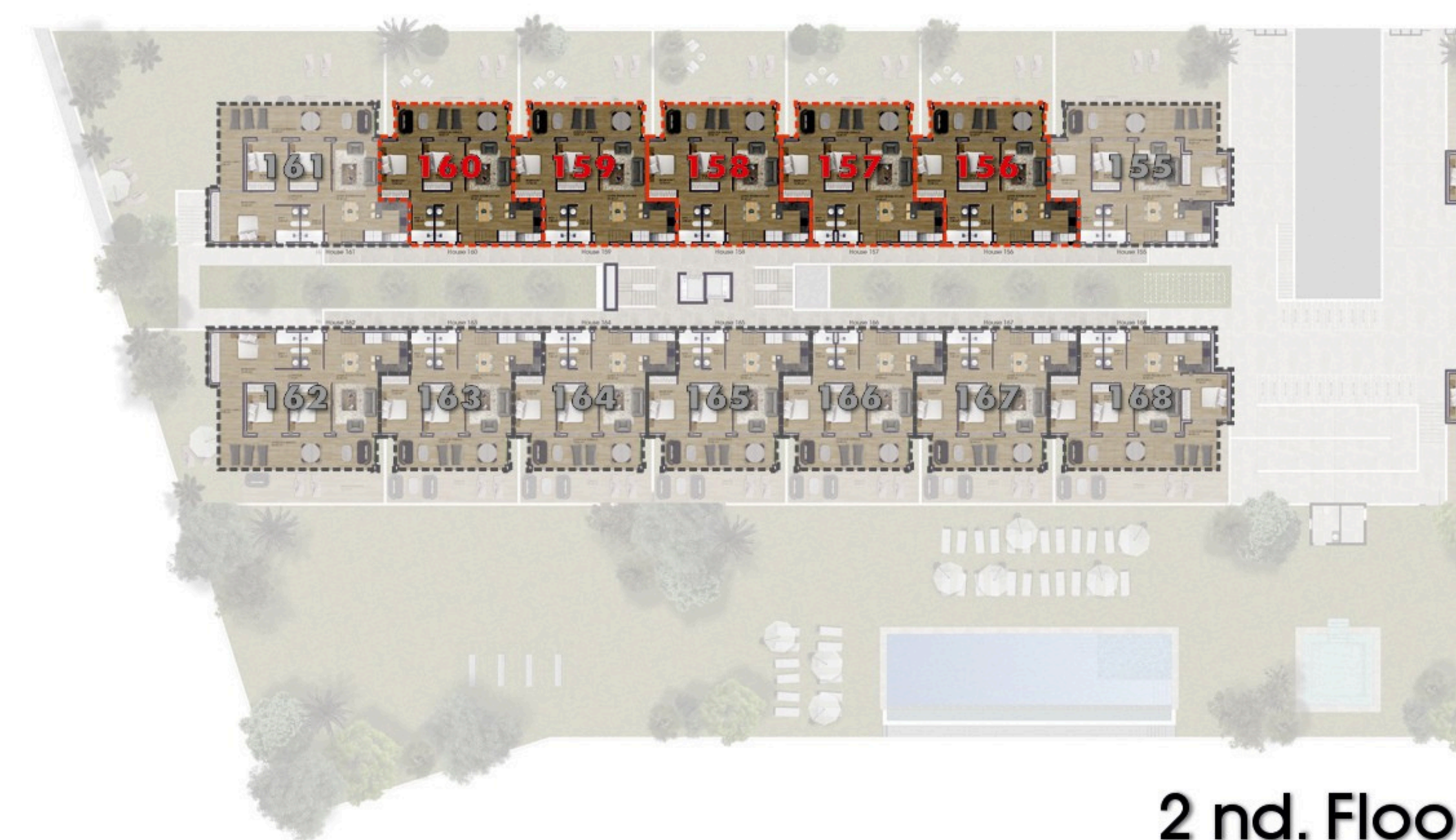
2 nd. Floor