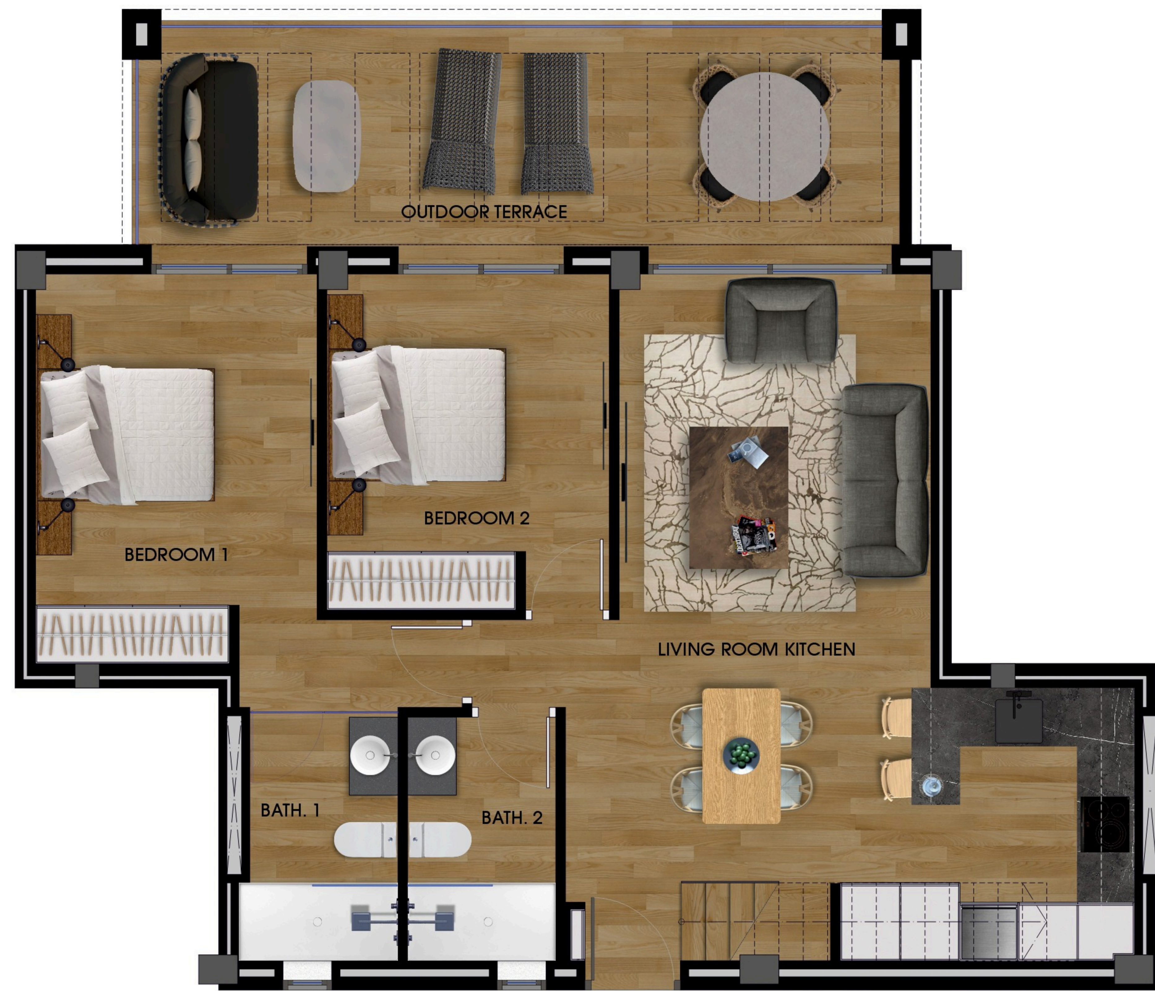
2 nd. FLOOR