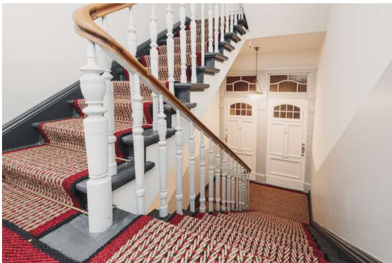
Staircase side wing