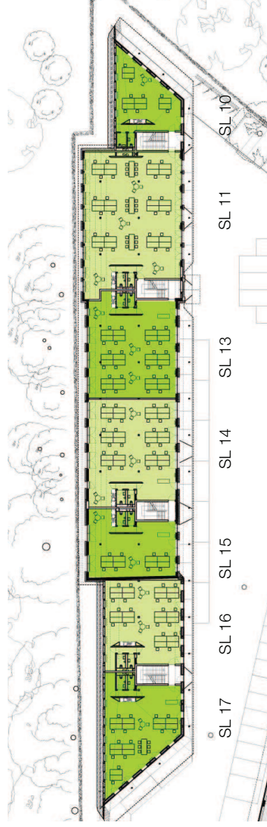
1.Obergeschoss BGF 1.440 m 2