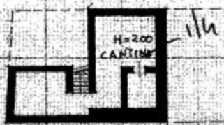
PIANTA PIANO SOTTOSTRADA