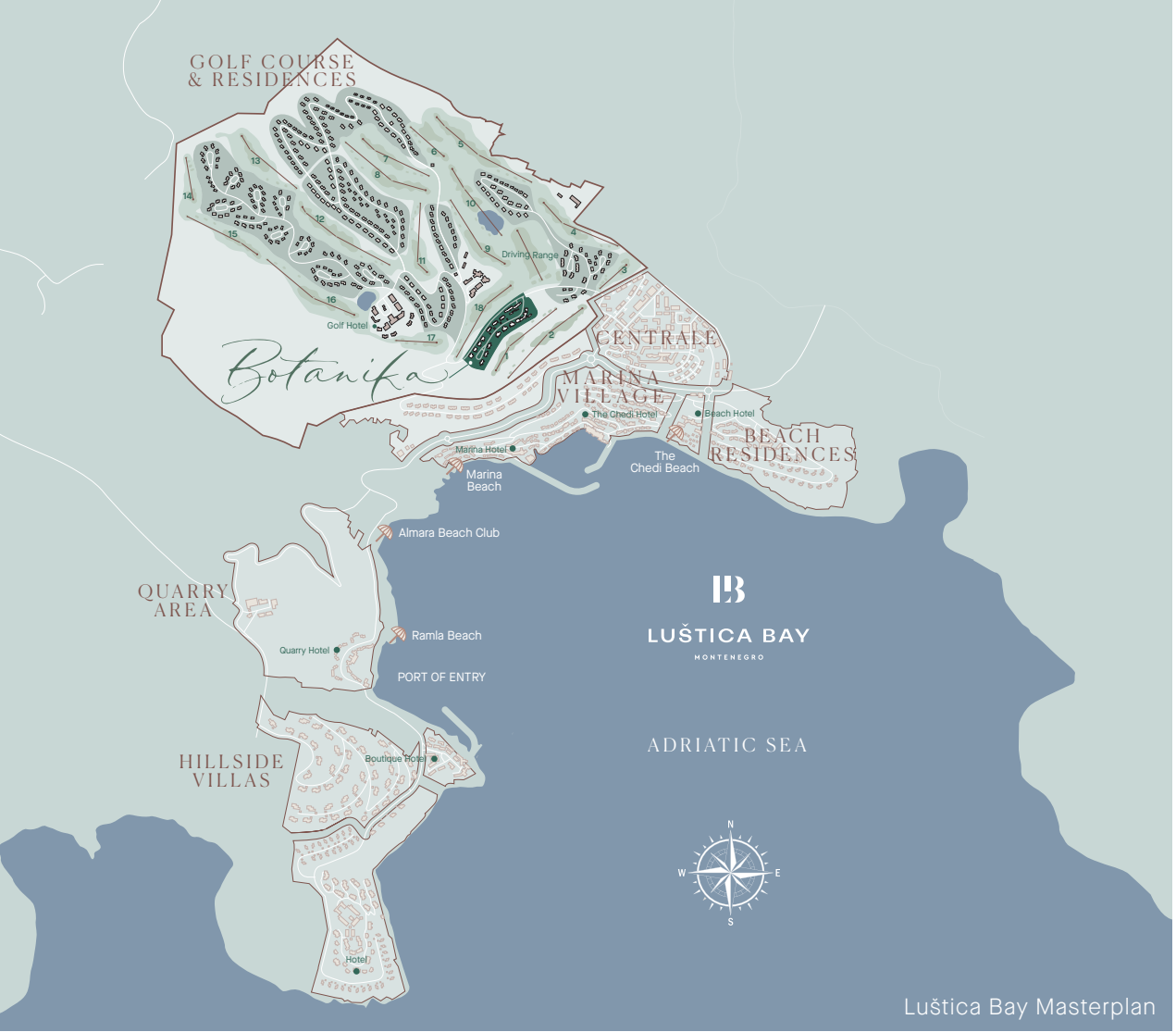
Luštica Bay Masterplan