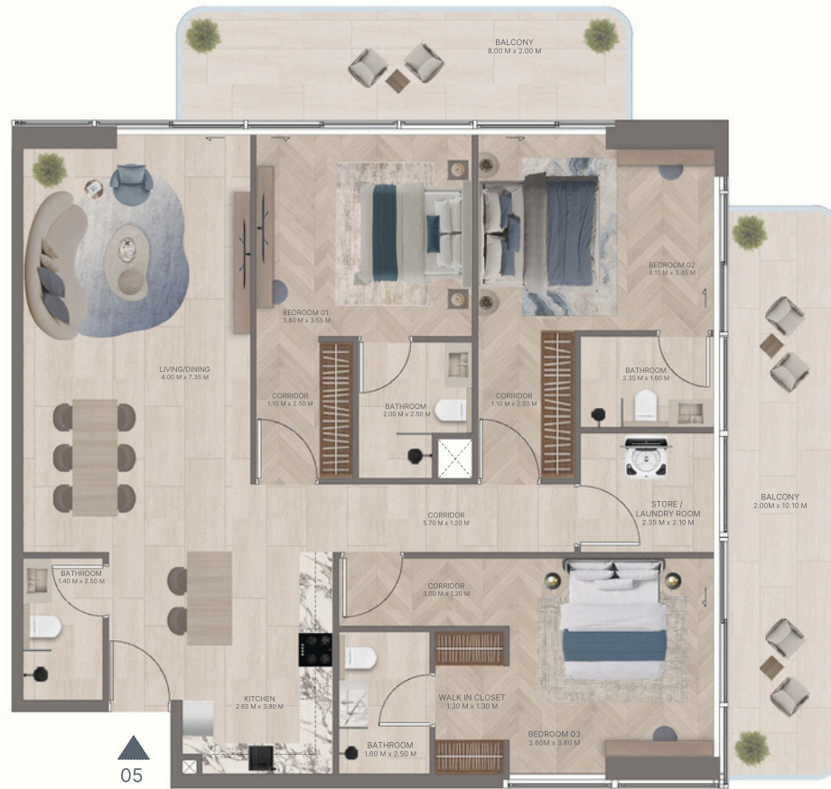
3 Bedroom Apartment Type A3