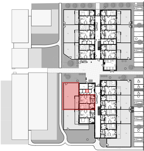
Übersichtsplan M 1:1000