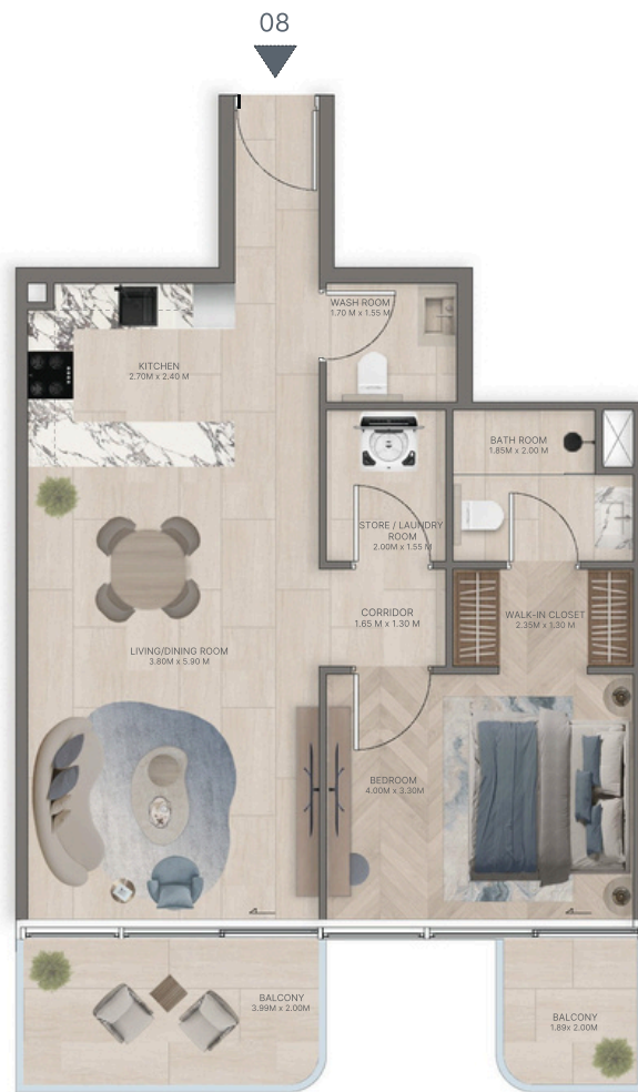
1 Bedroom Apartment Type B2