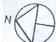
Grundriß im Maßstab 1:100