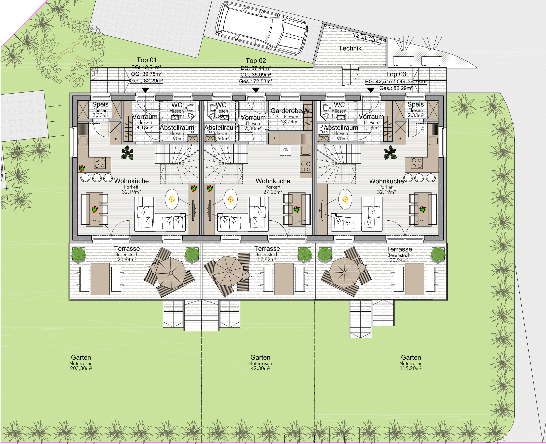
Haus 1 EG Top 1 - 3