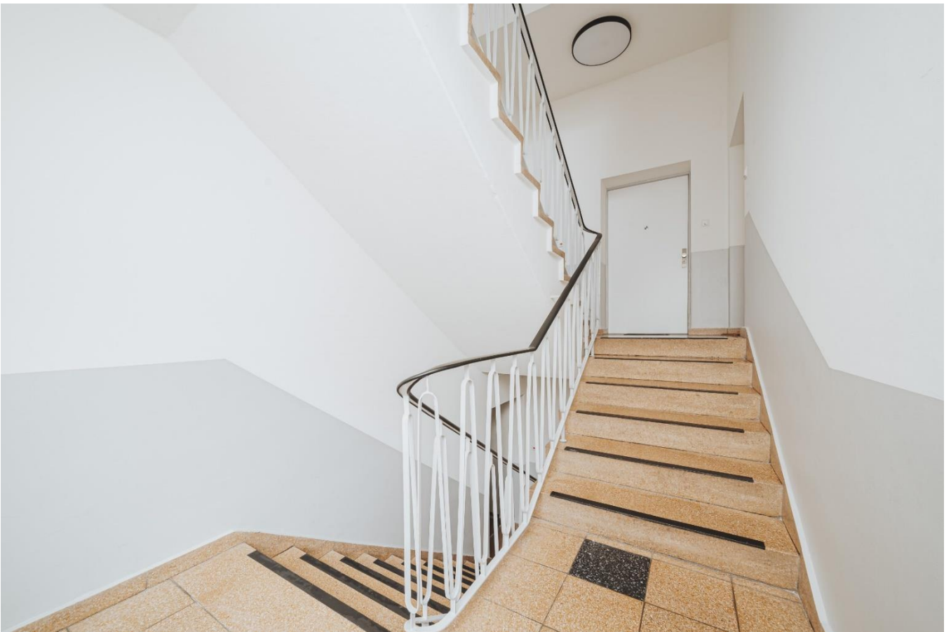
Staircase front building