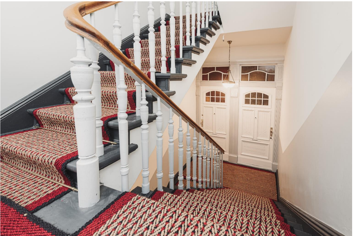
Staircase side wing