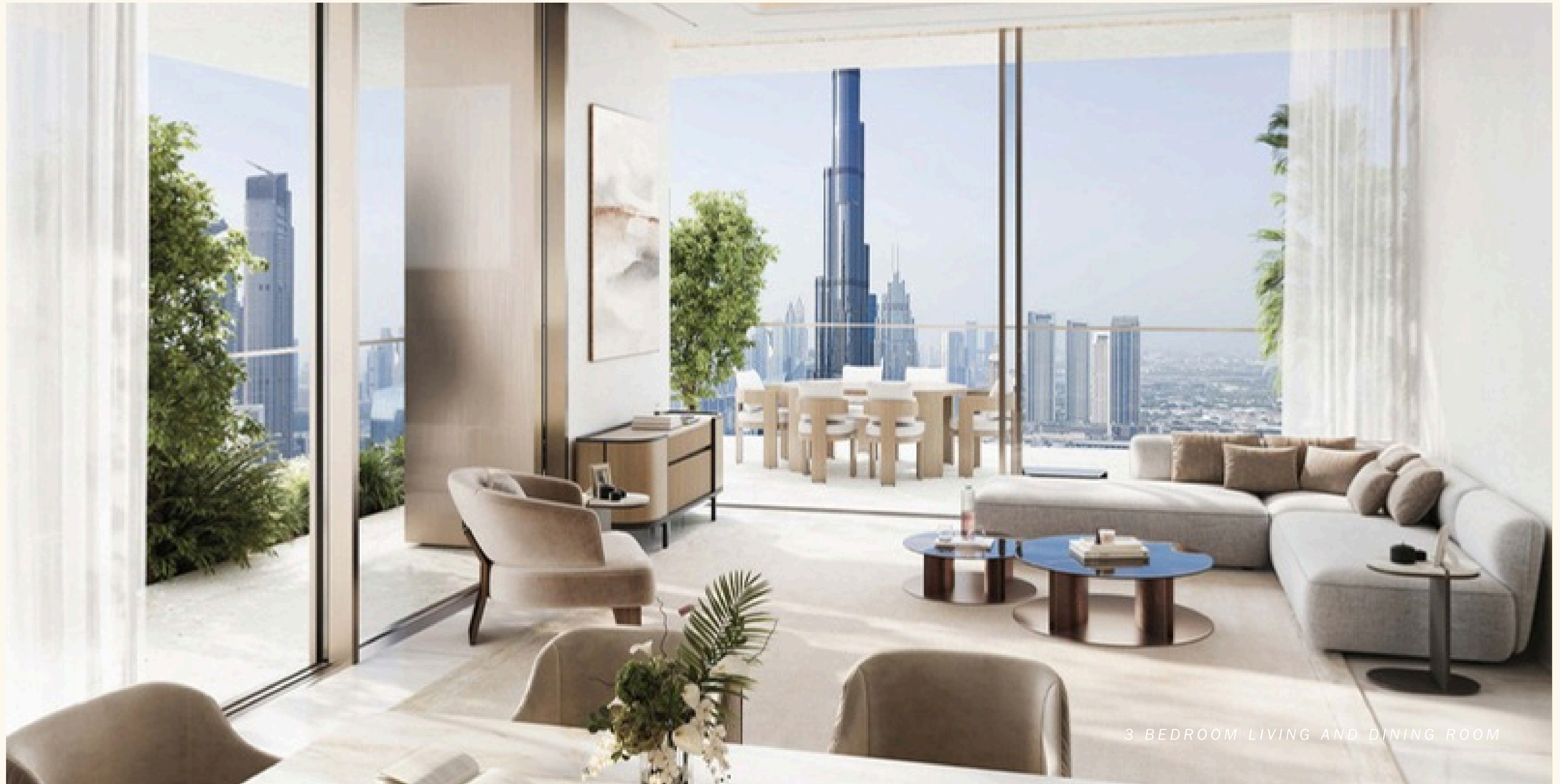
3 BEDROOM LIVING AND DINING ROOM