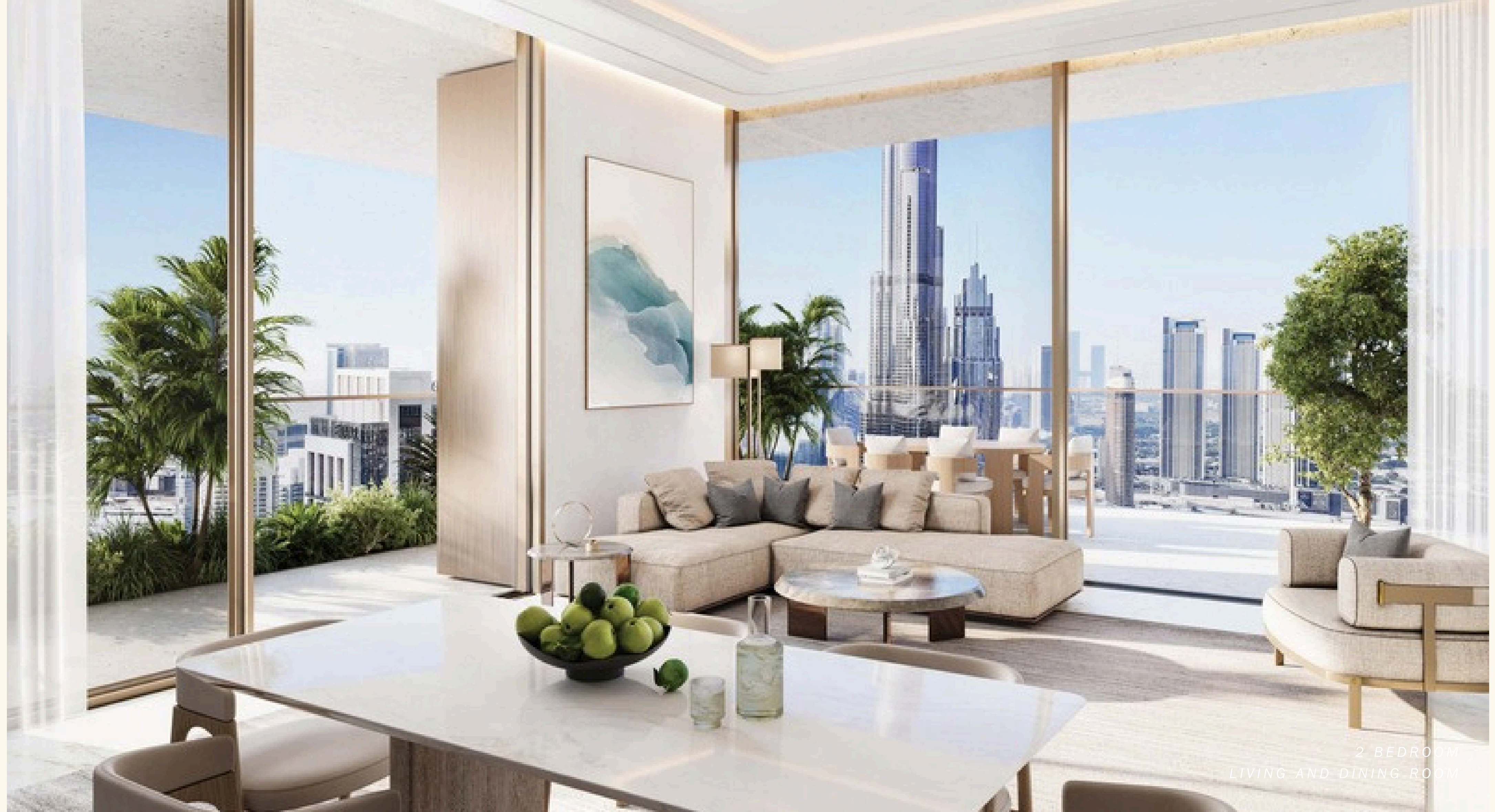
2 BEDROOM LIVING AND DINING ROOM

EXQUISITE SPACES FOR ENTERTAINING GUESTS, CONNECTING WITH LOVED ONES, OR SIMPLY DELIGHTING THE SENSES.