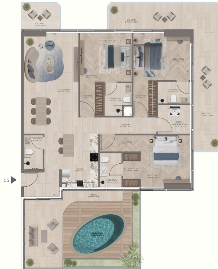
3 Bedroom Apartment Type B1