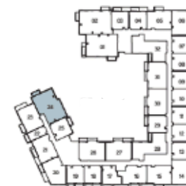
1 ST - 5 TH Floor