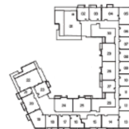
6 TH Floor