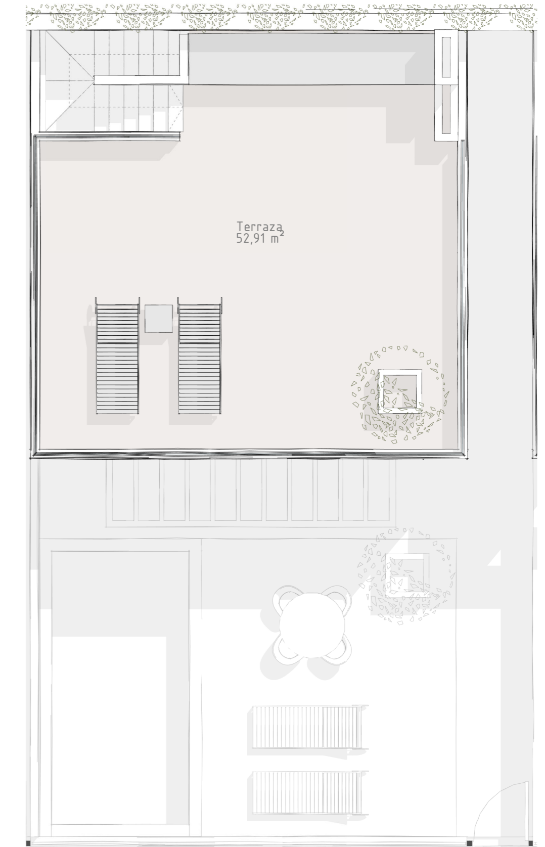
7.Viv. Unifamiliar. Terraza