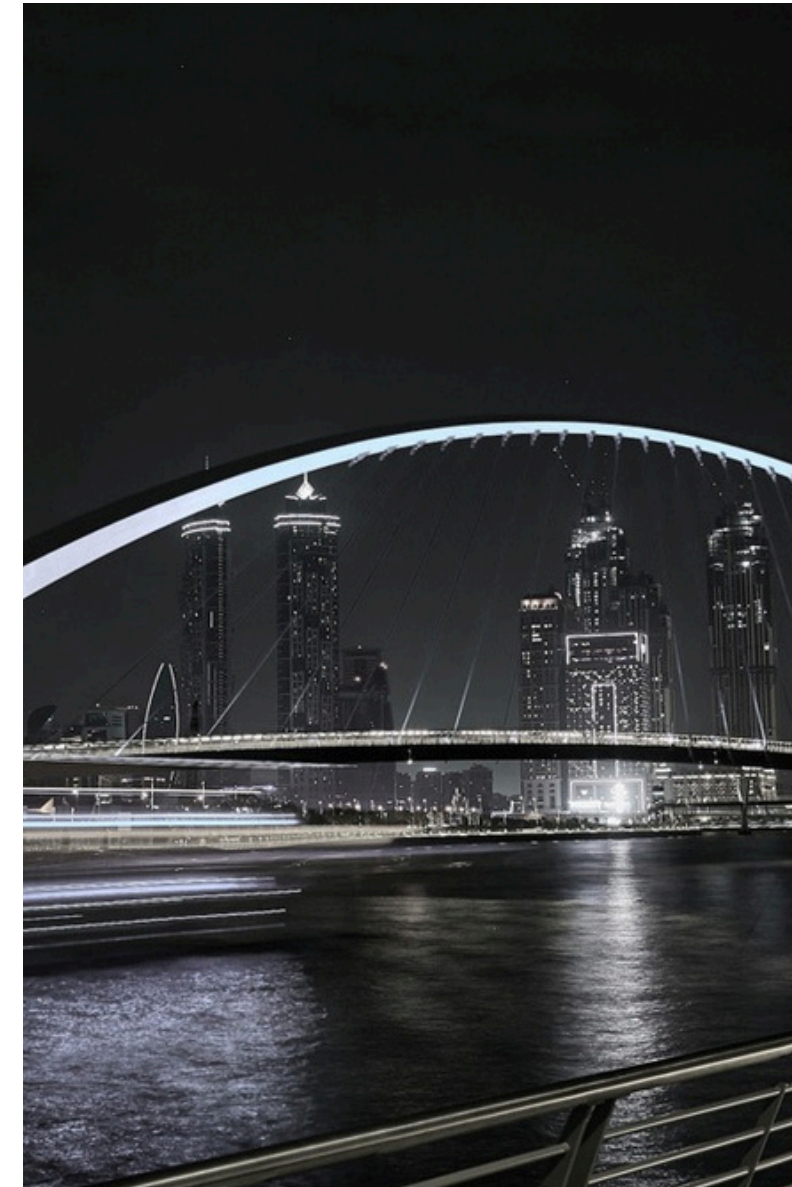
CANALSIDE COSMOPOLITAN WITH DUBAI WATER CANAL VIEWS

With its canalside spaces, collection of fitness amenities, and, of course, close connection to Downtown Dubai, residents of One River Point take full advantage of Dubai's wealth of opportunities.