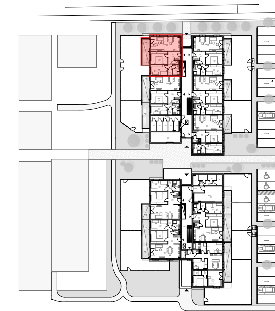
Übersichtsplan M 1:1000