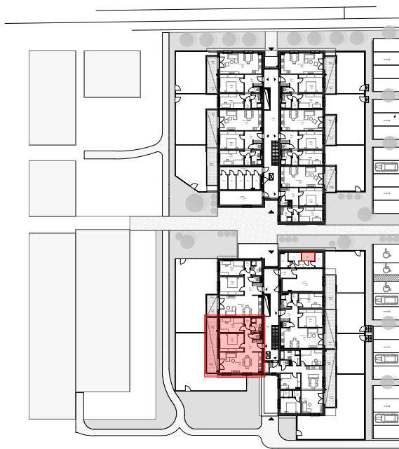
Übersichtsplan M 1:1000