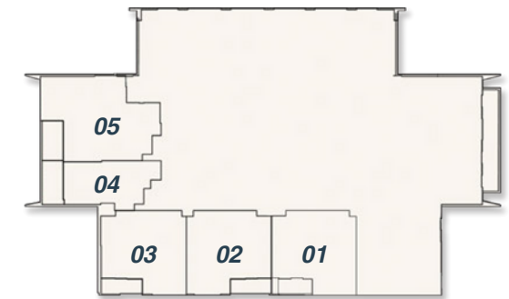
2 ND - 15 TH FLOOR