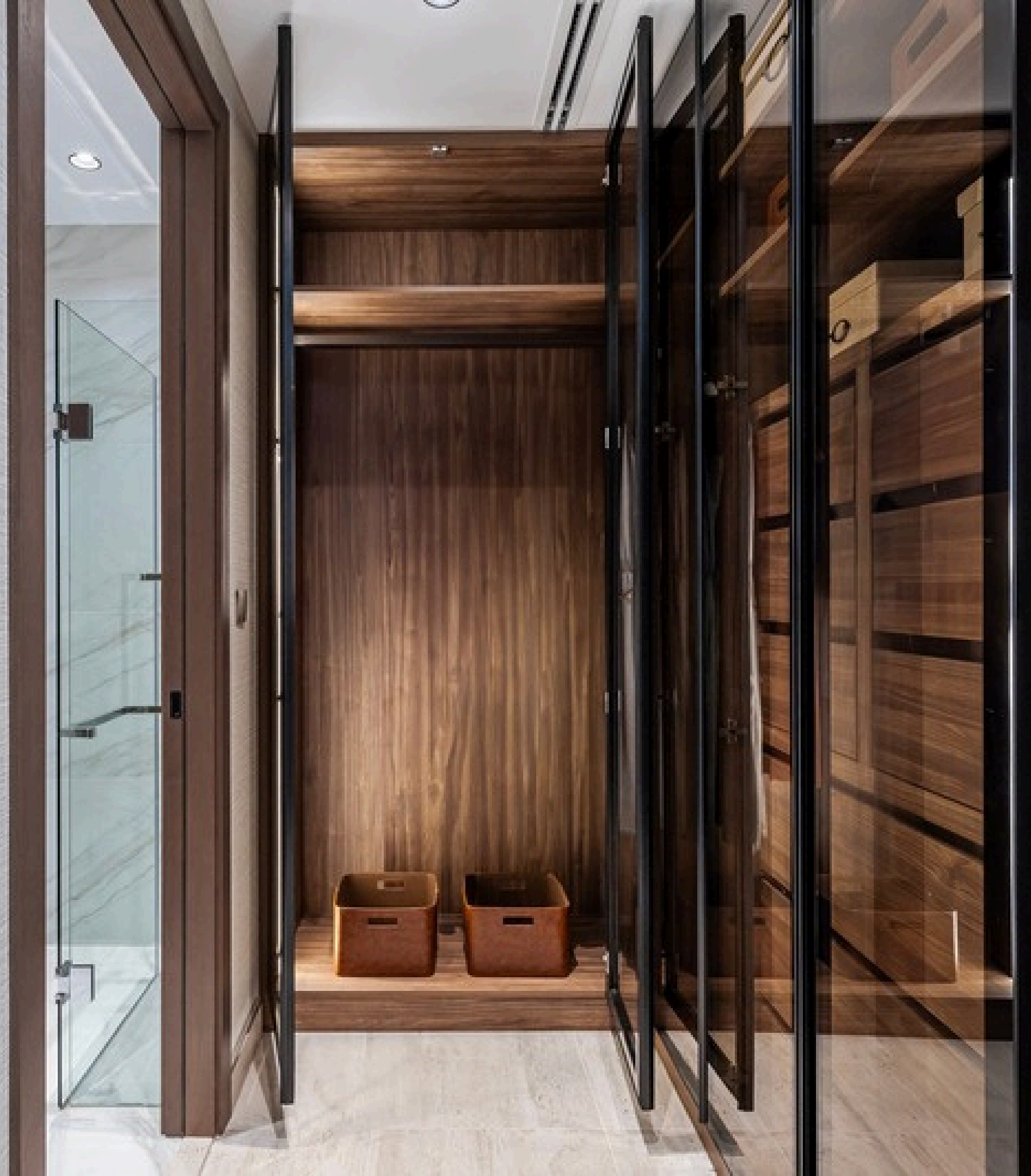
BUILT-IN CLOSETS Glass fronts, Automatic lighting