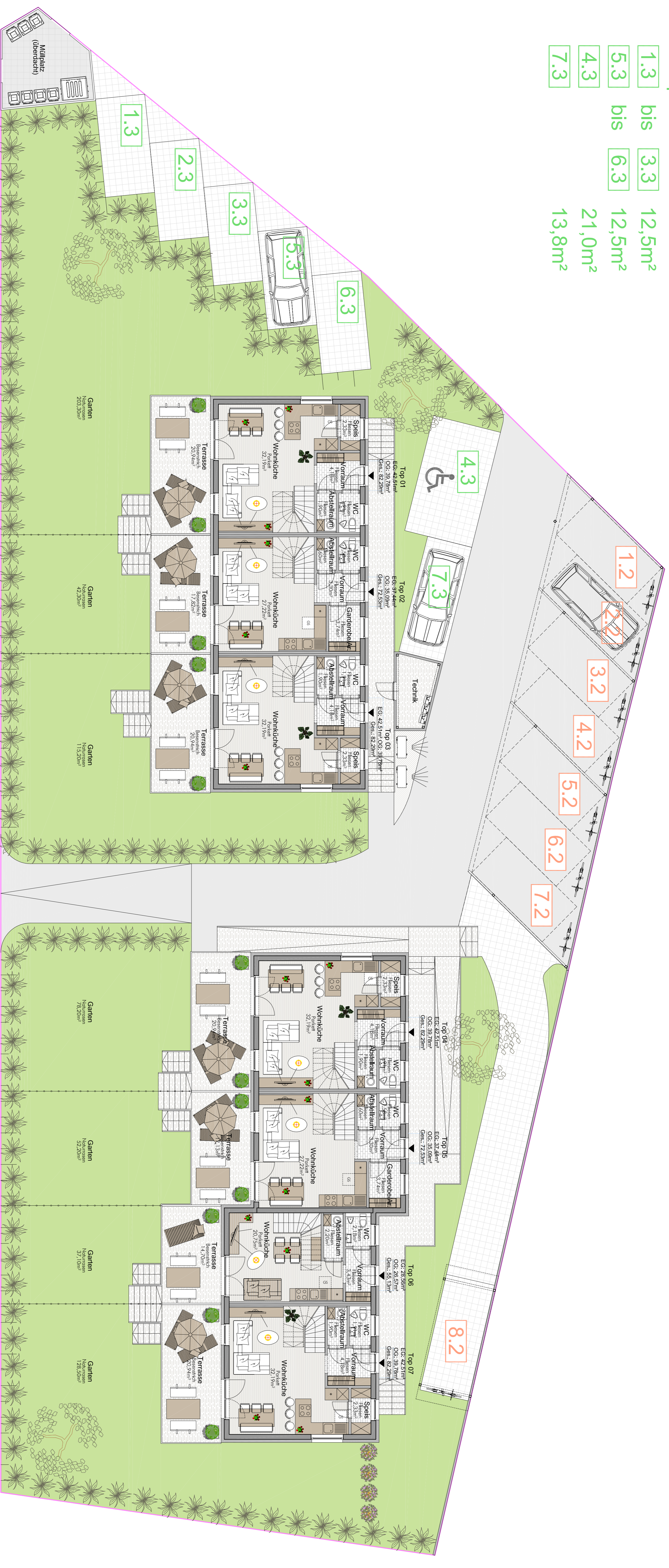
Haus 1 Top 1 - 3