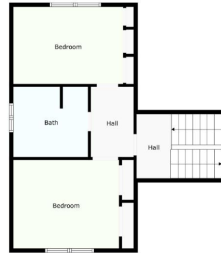
For Illustrative Purpose Only. May Not Be Perfectly To Scale.