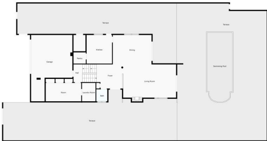
For Illustrative Purpose Only. May Not Be Perfectly To Scale.