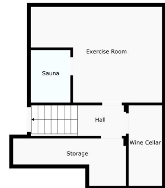
For Illustrative Purpose Only. May Not Be Perfectly To Scale.