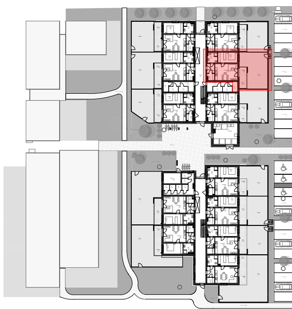
Übersichtsplan M 1:1000